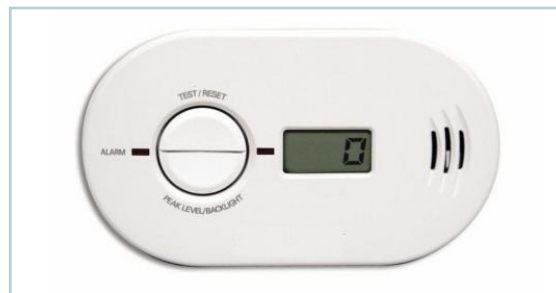
A Common Home CO Detector

Since carbon monoxide is colorless, odorless, and tasteless, the best way to alert your family is to install a carbon monoxide detector/alarm to warn of the gas's build-up.